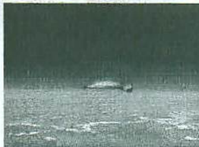
FRUIT FLIES: Geostationary Banana Over Texas